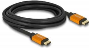
Copper wire with braiding and foil shielding