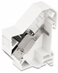
Anwendungsbeispiel mit Stecker