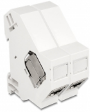
Anwendungsbeispiel mit Stecker