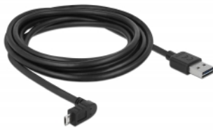
EASY-USB Micro B