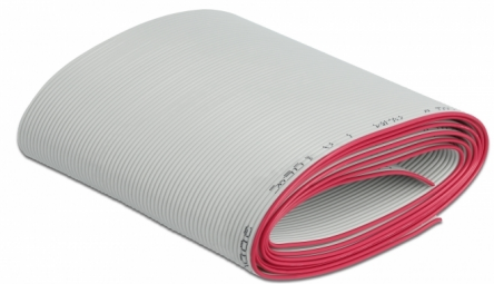
64 Pin / 1 m

This flat cable by Delock allows cable assembly with existing connectors for flat cables. The cable has 64 individual strands and can be used e.g. in test environments or in hobby applications.